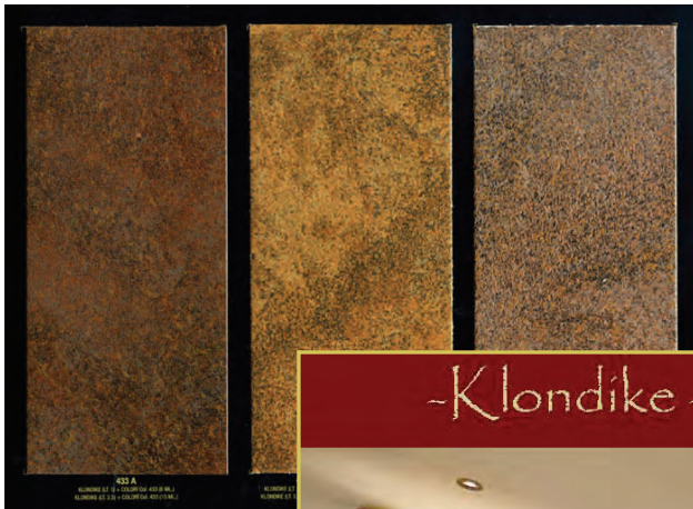
First page of Klondike Catalog