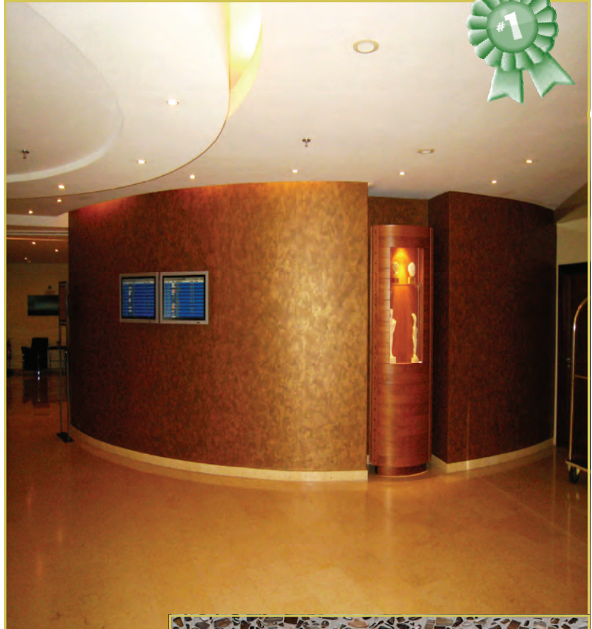
(right) Crystal Inlay example

Recent Klondike installation in a hotel lobby