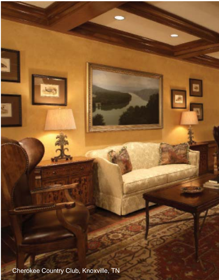
Cherokee Country Club, Knoxville, TN

Delta Crown Room, Seatac Airport, Seattle, WA