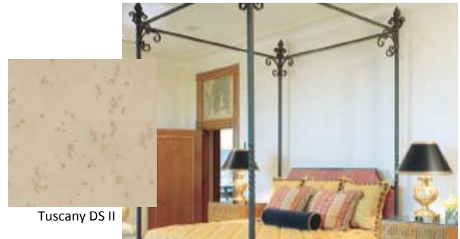
Tuscany DS II

Duroplex has been a national and international market leader for interior performance textures for more than 20 years. Duroplex has been chemically engineered to have a low carbon footprint and has been certified as SCS Indoor Advantage™ Gold for Indoor Air Quality; it provides maximum longevity, abuse resistance and resistance against mold or mildew. The advantages of Duroplex over traditional wall covering or other materials with a similar appearance make it the logical economic and aesthetic choice. It is backed by a ten (10) year warranty against surface mold or mildew growth and cracking or delamination. It is also 80% as hard as mild steel, noncombustible, integral & colorfast pigmentation and is breathable at 28 perms. Duroplex improves the abuse resistance of drywall and impact resistant boards. See our website for more information on abuse resistance and other performance related features. Eighty-six standard colors and 25 established textures or patterns, plus broad custom capabilities in both texture and color round out the product line for uncompromising value.