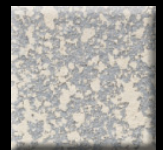
Ancient Stone DSII

Maximum longevity, abuse resistance and low maintenance costs. Duroplex offers performance & aesthetics with design freedom.