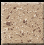
Spray Pattern DS III