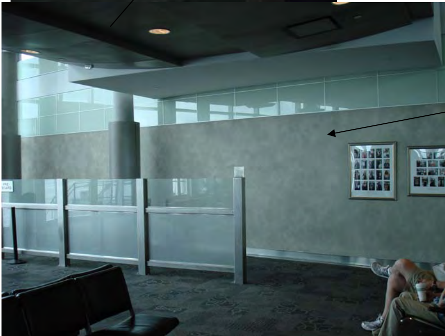
Typical Passenger Gate Area & Representative Duroplex® Flagstone DS II (Grey & white combination)