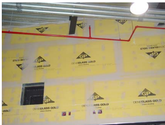
Typical G-P DensGlass substrate

As an open air stadium, the Duroplex not only has to withstand the several million people per year that move through the stadium, but it has to withstand all the elements that St. Louis might have to offer, driving rain, sleet, snow, sub freezing temperatures and some very hot summers. According to our rep, Jeff Alldredge, a huge Cardinals fan, today the stadium looks as good as the day it opened in 2006. My only question is: how much credit can Duroplex take for the Cardinals game?