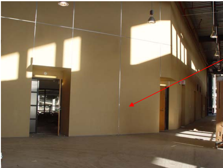
Duroplex Antigua DS II