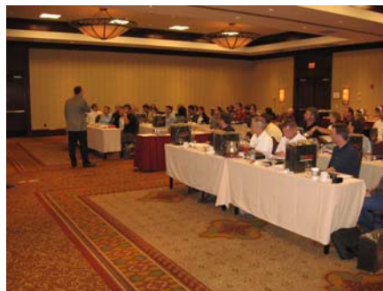
Conference Room Presentations

Over 50 people from a cross section of sales reps, distributors and customers attended the recent Triarch business meeting in Rhode Island in mid September. At the meeting new presentation tools