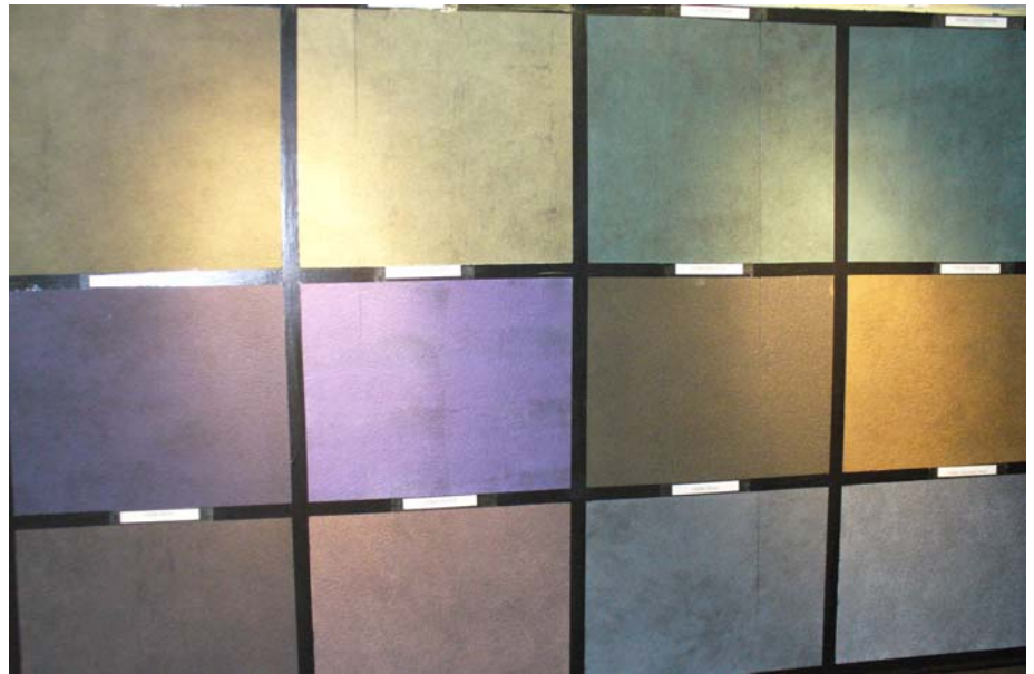
DDM2 Wet Wall Presentation